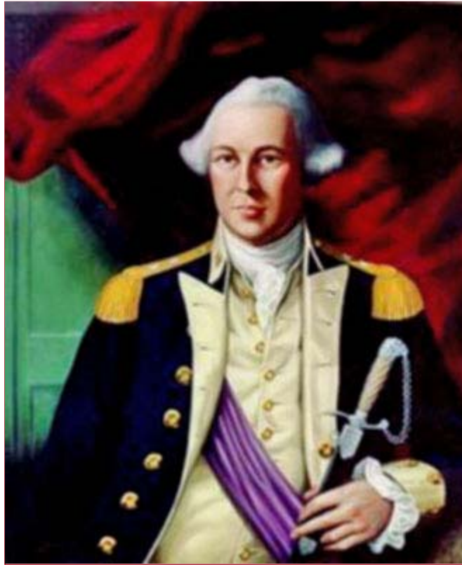
General Joseph Warren

All US Masonic lodges are to this day warranted by the British Crown, whom they serve as a global intelligence and counterrevolutionary subversion network.